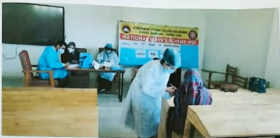
COVID-19 Vaccination Drive 29-07-2021