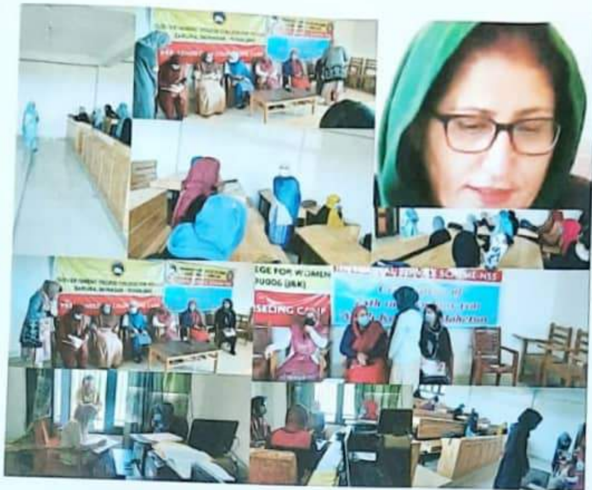
Pre-Admission Counselling Camp/ Workshop for 3 rd and 4 th semester students 06-10-2021 to 12-10-2021