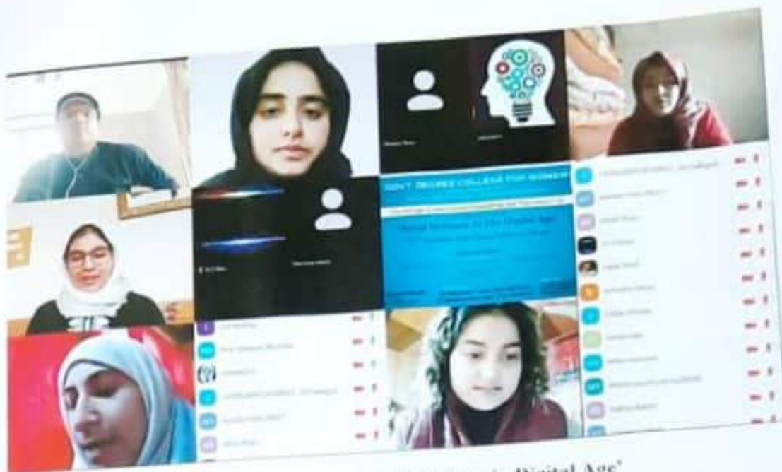
Online Debate on "Social Wellness in Digital Age" 25-12-2021