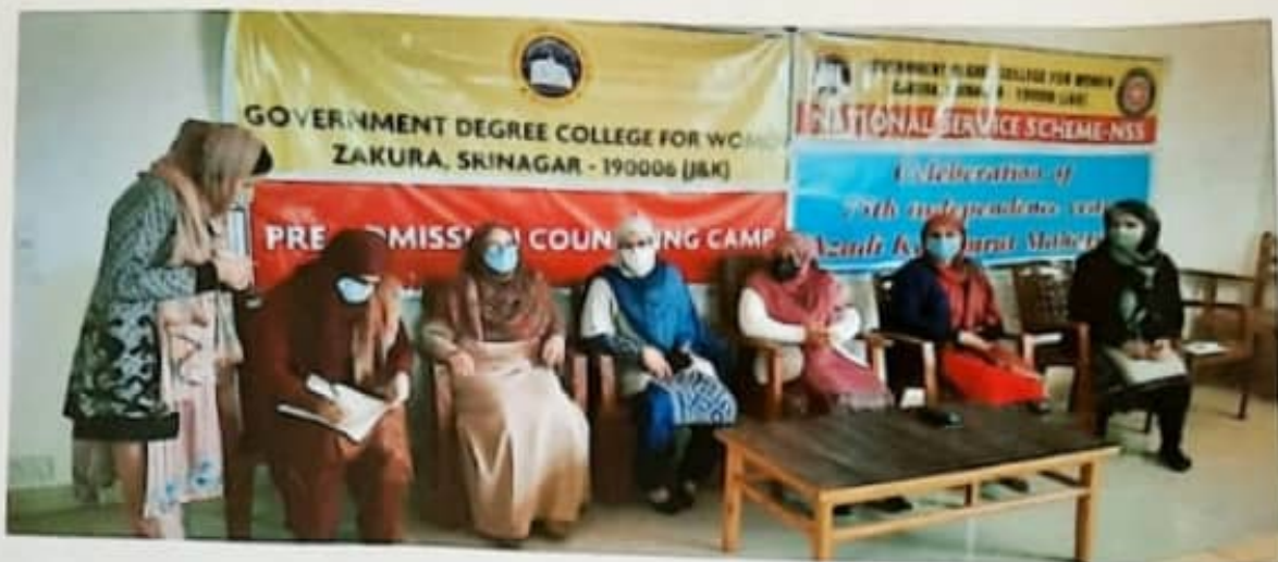
Pre-Admission Counselling Camp/Workshop 26-03-2021 to 01-04-2021