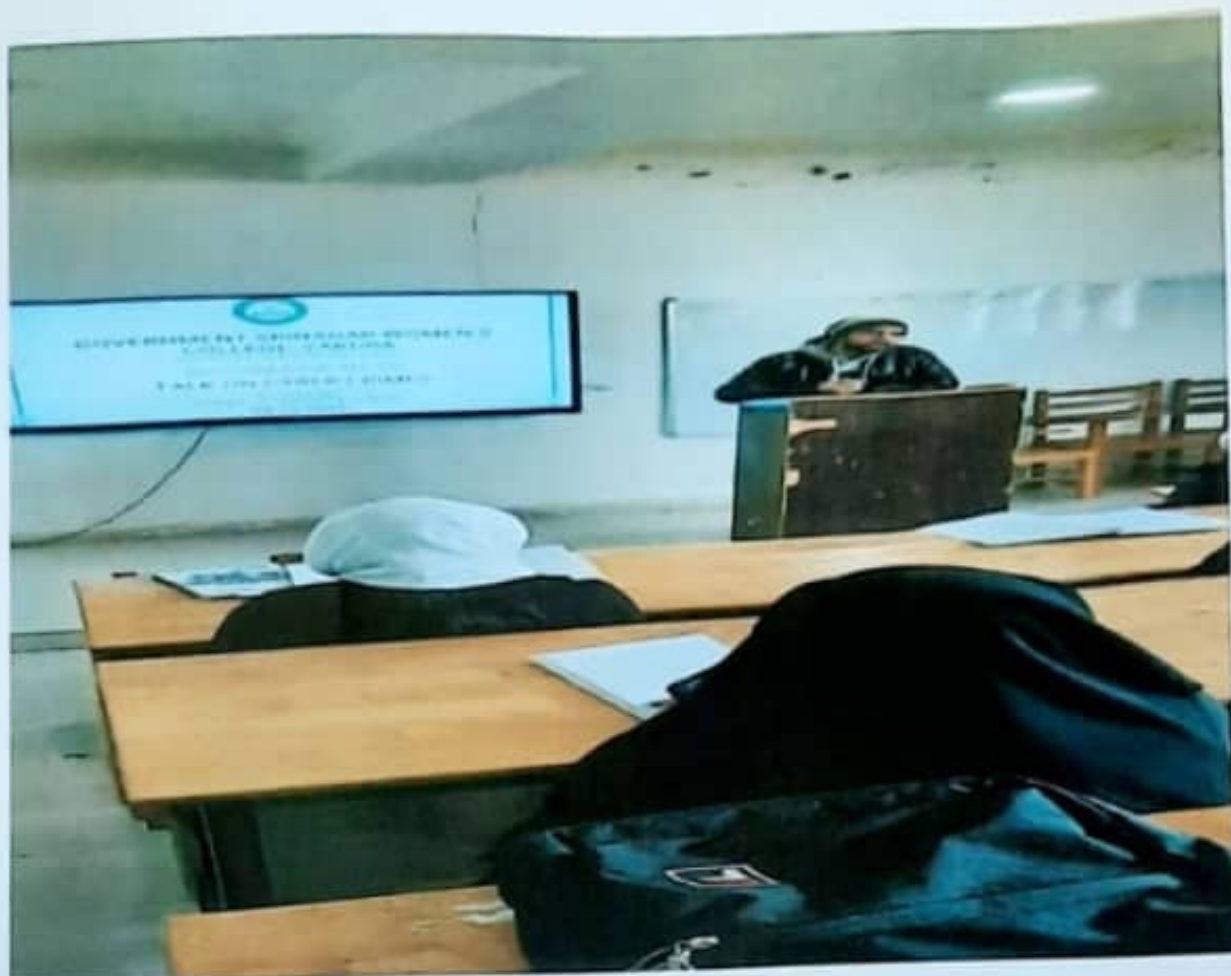
Talk on Cyber Crime Cyber Jaagrukta Awareness Diwas 09-12-2021