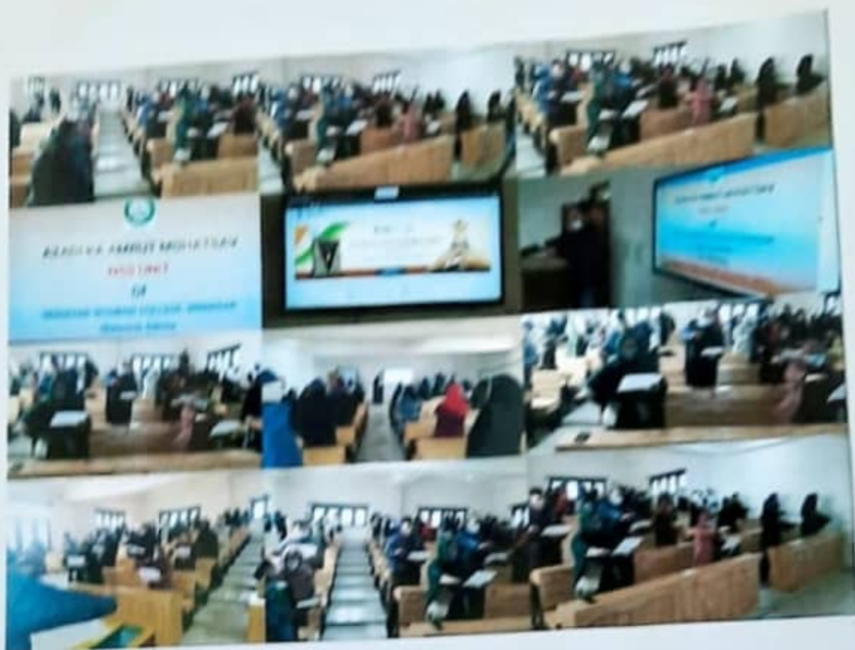
Constitution Day 26-11-2021