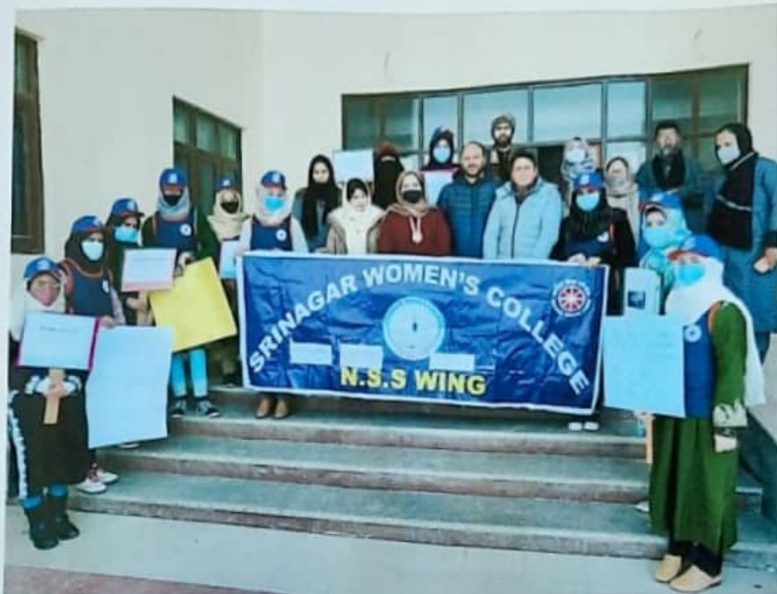
National Youth Day 14-01-2021